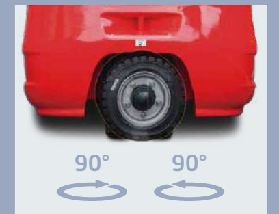
The small turning radius is suitable for narrow channel