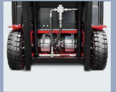
Front dual separated motors