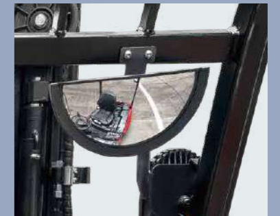
Panoramic rearview mirror