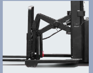
Forks move forward by the scissor structure