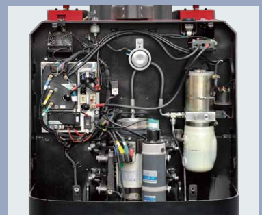
Fully opened hood, easy accessibility of all components, is easy for service