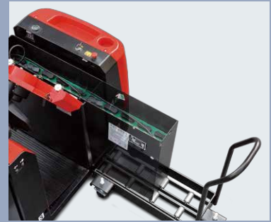
Side battery changes is standard feature