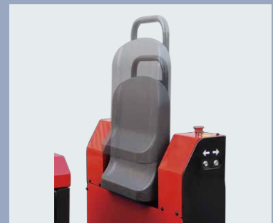
Backrest height can be adjusted within a certain range, and the backrest with hip support can greatly improve the comfort of the operator